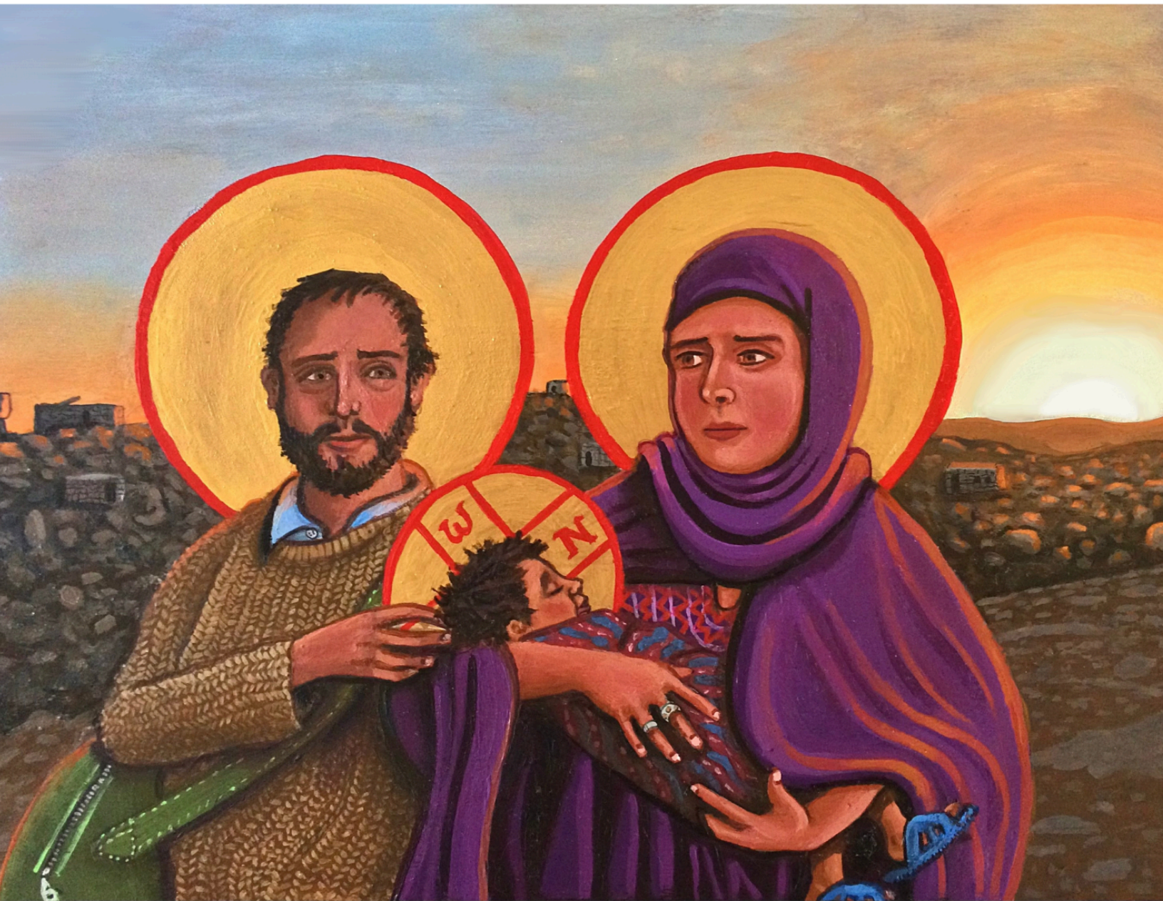
Image: Refugees: The Holy Family by Iconographer Kelly Latimore, printed with permission