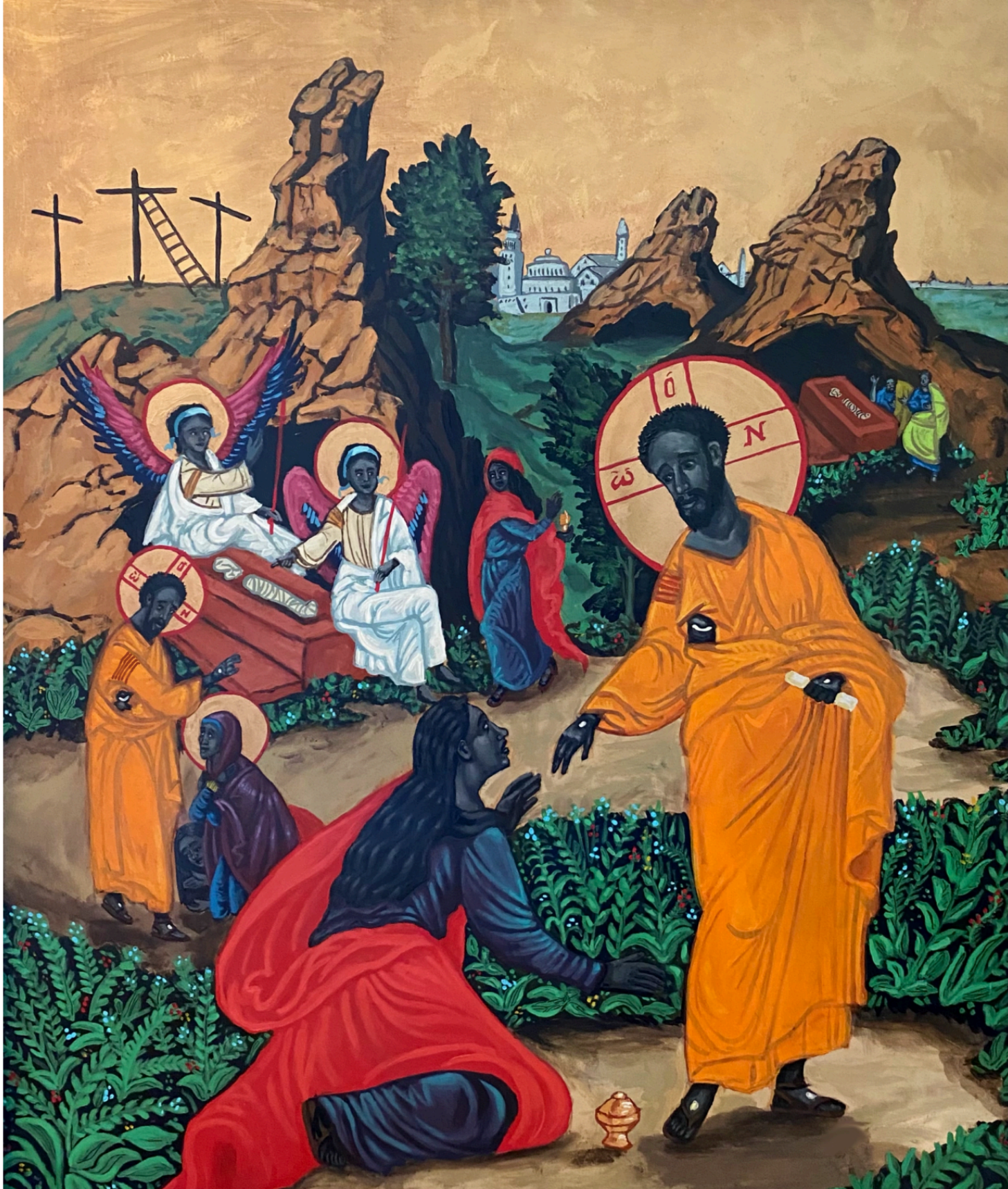
Image: The Resurrection by Iconographer Kelly Latimore, printed with permission